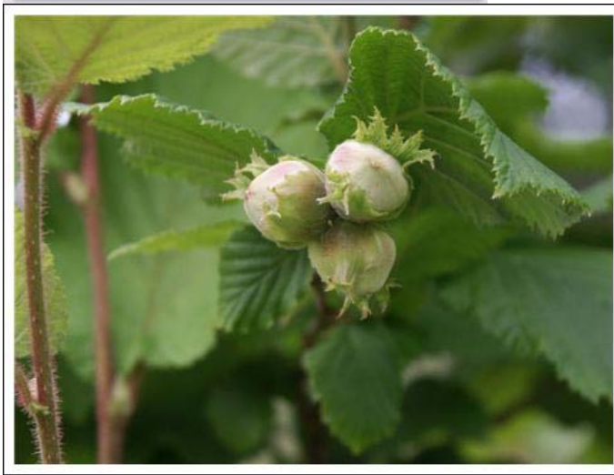
Even the hazelnuts are looking good.