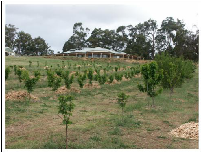
The house from the Fruit tree part of the block.